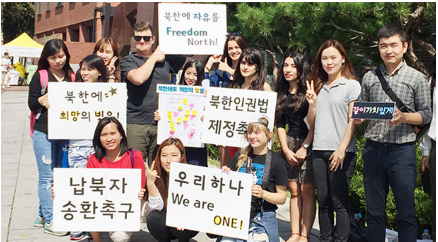
Group from Woorihana

My time at UNESCO and Woorihana allowed me to make inroads in my thesis research. I was able to meet with professionals, activists, professors, and students in various educational institutions, human rights NGOs, and the government. After my summer in South Korea, I have come back to Columbia with more knowledge, experience, and passion for my graduate studies.