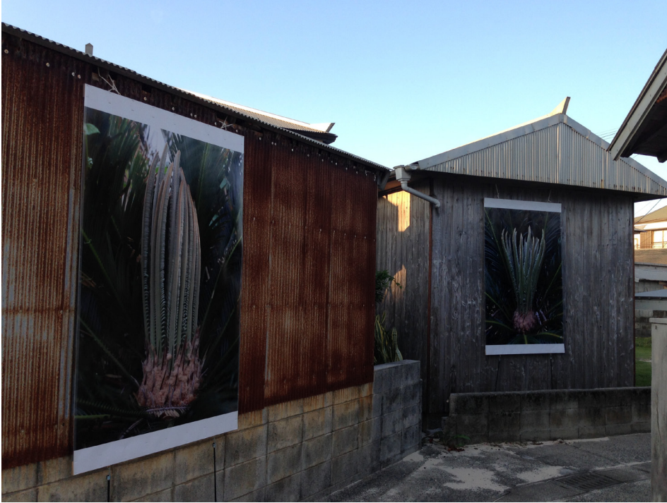
Miyamoto's photographs hanging outdoors on Tokunoshima Island