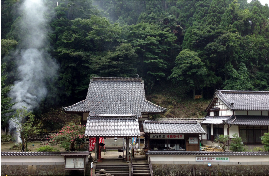
The area around the Iwami Ginzan Rakanji silver mine in Shimane Prefecture

Thanks to the support provided by a WEAI Mitsui Research Fellowship, I was able to make important strides toward researching my dissertation and gaining language preparation for research in Europe. I just completed a trip through southern and central Japan, including time spent on-site at institutions in Nagasaki, Iwami Ginzan, Sakai, and Kobe. I also took advantage of the travel opportunities afforded by my summer funding to meet with scholars and graduate students active in my field in Kyoto and Nagoya, augmenting both my professional network and my preparation for fieldwork in Europe this fall.