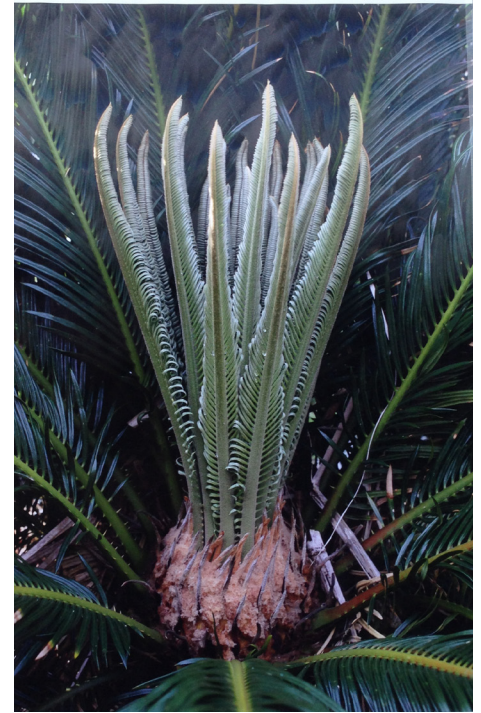
The blossoming of a sotetsu palm tree