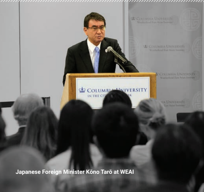
Japanese Foreign Minister Kōno Tarō at WEAI