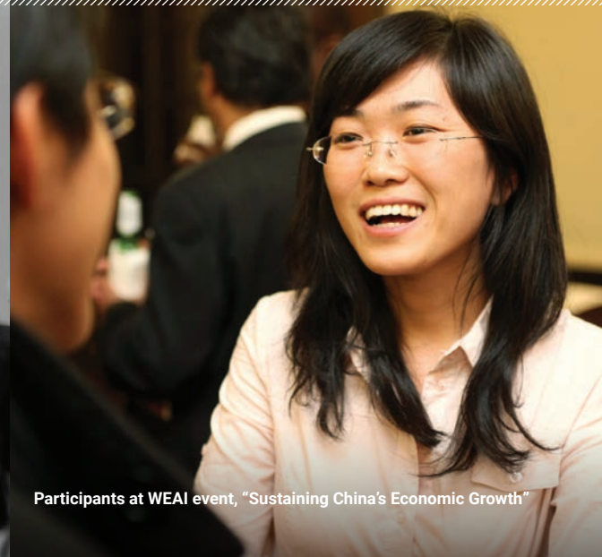
Participants at WEAI event, "Sustaining China's Economic Growth"