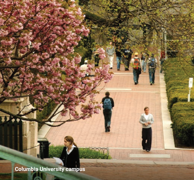
Columbia University campus