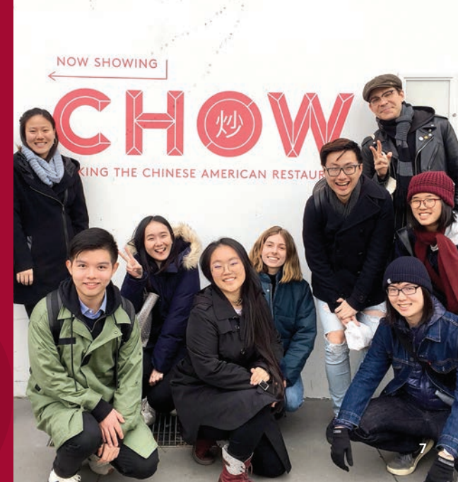
MARSEA students visit the Museum of Food and Drink

WEAI offers funding for research, language acquisition, unpaid internships, and dissertation write-up to select Columbia students.