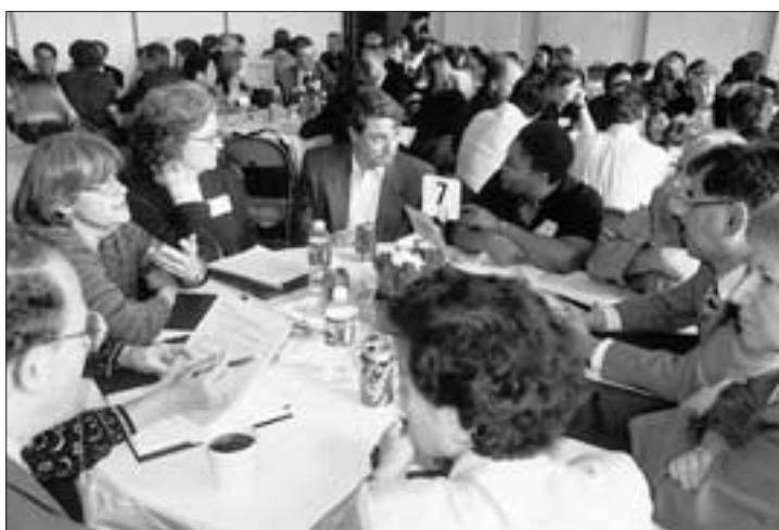
| Lunch table discussion at the Symposium on Asia in the Curriculum. |

Other events sponsored by the Institute that require more room take place in larger meeting spaces on the Columbia campus. During 2002–2003, these latter events included the following: