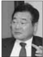
Koichi Kato Visiting lecturer