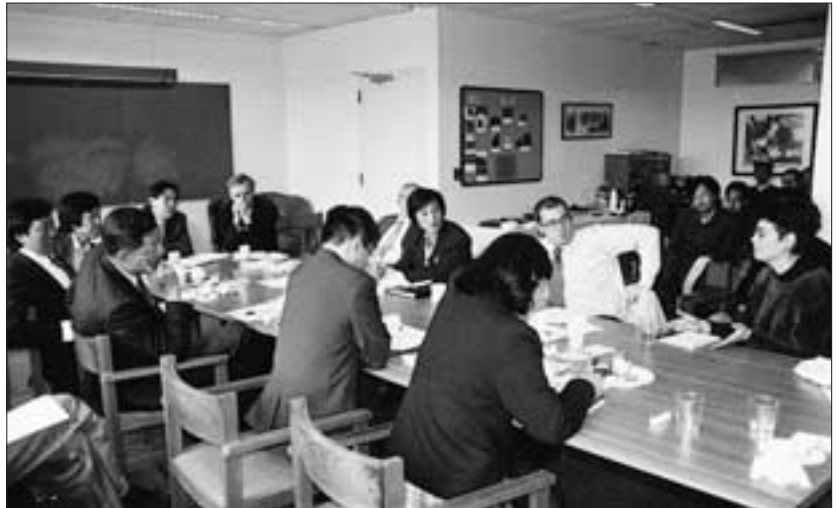
| Visiting scholars from the Brookings Institution’s Northeast Asia program met for a roundtable discussion with Institute scholars in Room 918, IAB, May 6, 2003. |