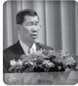
Keynote speaker Vincent C. Siew, vice president of the Republic of China (Taiwan)

“Taiwan in the Twenty-First Century: Politics, Economy, and Society” was held on June 13, 2010, at the Shangri-La’s Far Eastern Plaza Hotel in Taipei, Taiwan. Support was provided by the Columbia Alumni Association.