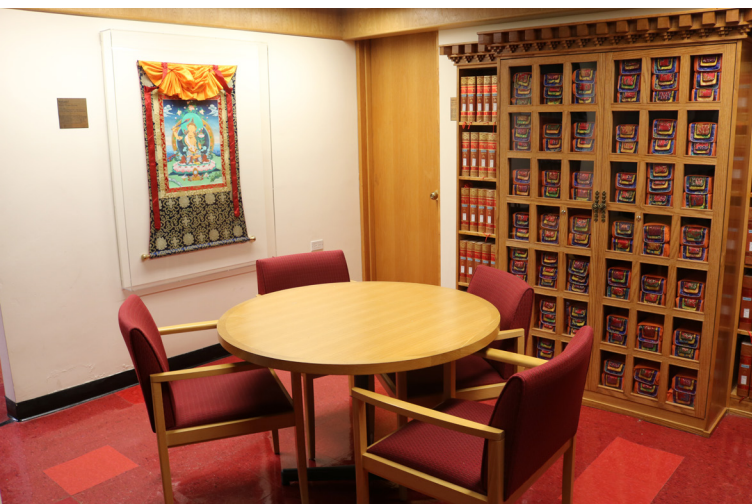
A popular study spot in the stacks of the C.V. Starr East Asian Library.

research library, we also have current novels, magazines, and newspapers from China, Japan, Korea, and Tibet; users from those countries come here like it's their local library at home." Increased interest in East Asia and East Asian studies is also responsible for bringing more readers to the library. And with its quiet, elegant reading room and striking stained glass window, even students with no connection to East Asia are drawn to the space. Now, Harlin said, it is not uncommon for every seat to be filled.