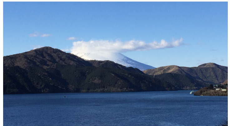
Mt. Fuji behind clouds over Lake Ashi in Hakone

My Fulbright term ended in July and I'll be starting as a Toshizo Watanabe Fellow at the Yokohama Inter-University Center (IUC) for Japanese Language Studies in September. IUC will allow me to work on the problem areas I identified in my language ability over the past year. I'm also glad to put a little distance between myself and the Tokyo city center; Yokohama is much more relaxed. After that, I have no idea where I'll end up! I think I'd like to come back to the US for now, whether that means working or entering a graduate program. I'm sending out a variety of applications and I'm excited to see what comes back. I'm shifting my research emphasis to the intersection of performing arts and visual arts in East Asian history with a focus on Japanese liturgical dance and issues of audience across media. I think it'll open up some exciting horizons.