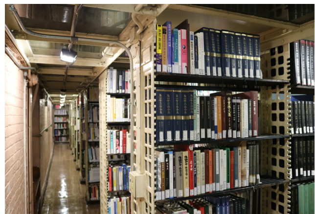
A section of the recently recovered stacks, with East Asian books properly reshelfed.