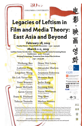
A poster for the Legacies of Leftism conference, which was held from February 28-March 2, 2019.