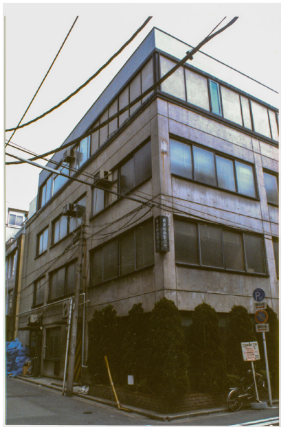
The Iwanami Productions building in Tokyo during the 1960s-70s.

Q: What led you to Columbia initially and the Weatherhead East Asian Institute? When did you join WEAI and what is your impression of the Institute so far? Has joining the Institute had any impact on your work?