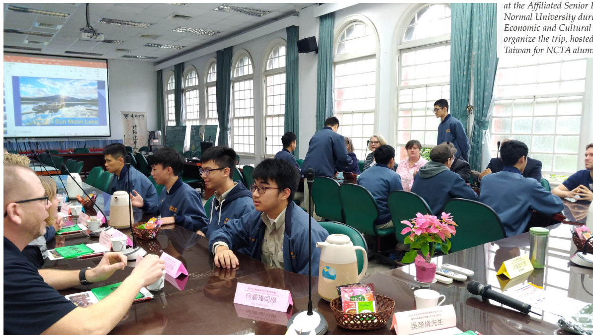
Representatives of the National Consortium for Teaching about Asia (NCTA) interact with students at the Affiliated Senior High School of Taiwan Normal University during a study tour. The Taiwan Economic and Cultural Office in New York helped organize the trip, hosted by the government of Taiwan for NCTA alumni teachers.