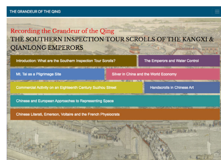
A screenshot of teaching materials on the AFE site on the Qing dynasty.