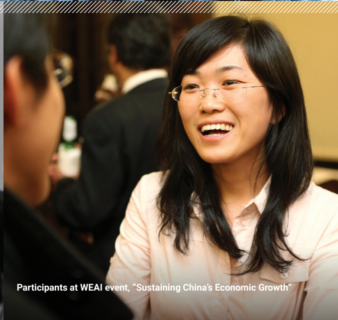
Participants at WEAI event, "Sustaining China's Economic Growth"