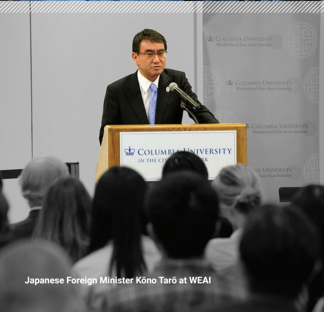
Japanese Foreign Minister Kōno Tarō at WEAI