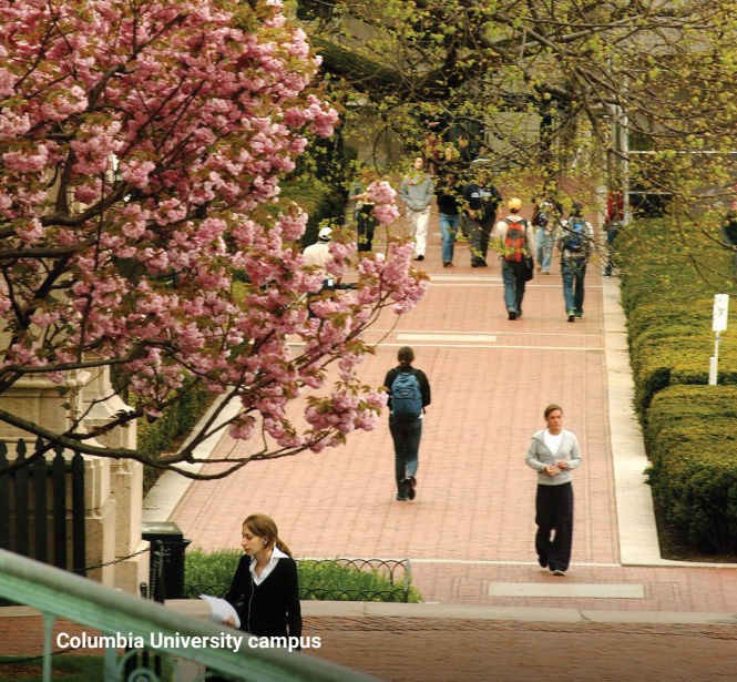
Columbia University campus